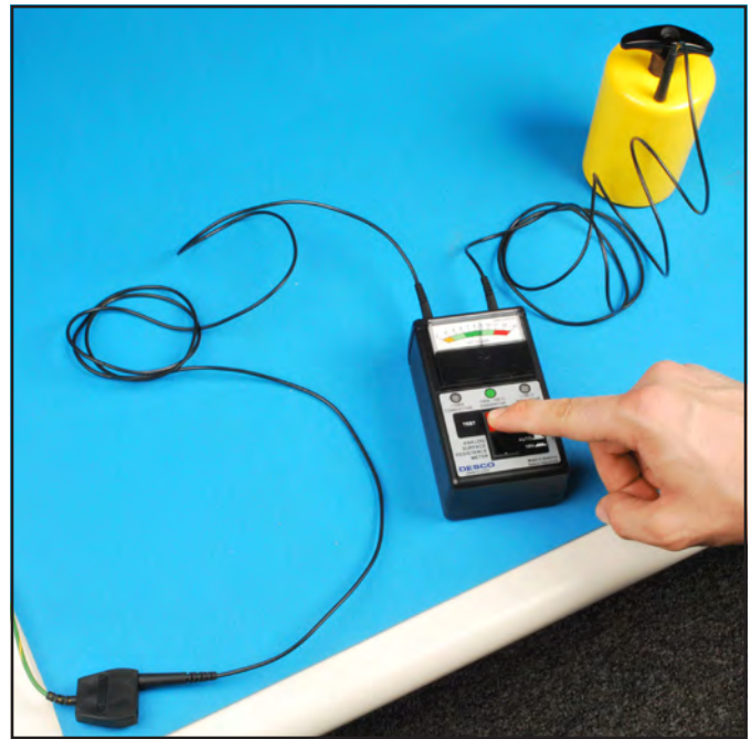
Figure 3. Using the test leads and one 5 pound electrode to measure RTG

CAUTION: If there is a current limiting resistor in the worksurface and the worksurface resistance is lower, the measurement will primarily be the resistance of the resistor. It is recommended to measure RTT particularly if the material color is black.