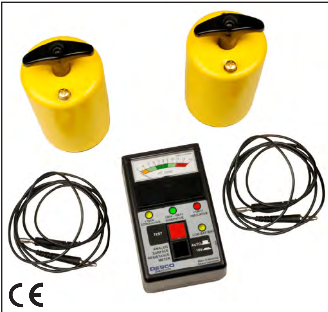
Figure 1. Desco 19784 Analog Surface Resistance Test Kit