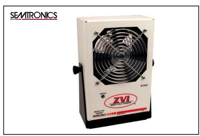
Figure 1. 62204 Zero Vold Bench Top Ionizer